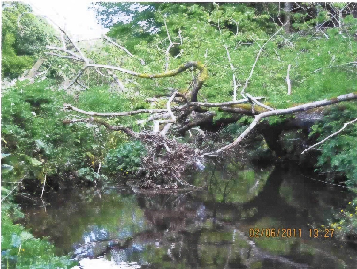
Pic 1 before, a mature Ash tree down blocking all access

My date of completion of the Goval burn will now be 2 nd week of June, due to other tasks over the river catchment. There are only 4 obstacles left to do, all wind blown trees. Two were found through survey work and the other 2 fell during severe gale force winds in May. Over all we have removed 24 obstructions, mostly mature hard wood trees which have been rotten at the bases. I have included in the next page, one of the trees we removed yesterday the 2 nd June.